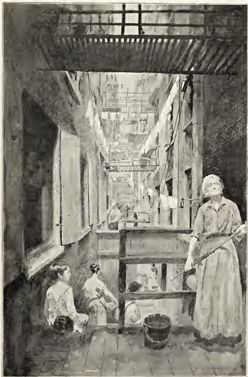
THE MOTT STREET BARRACKS.